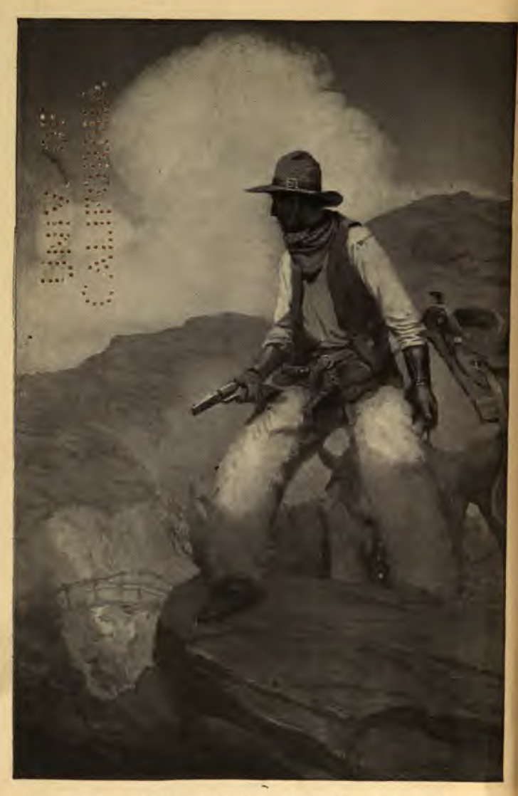
It was a long pistol shot and he was afraid that he might miss. FRONTISPIECE. See Page 205.